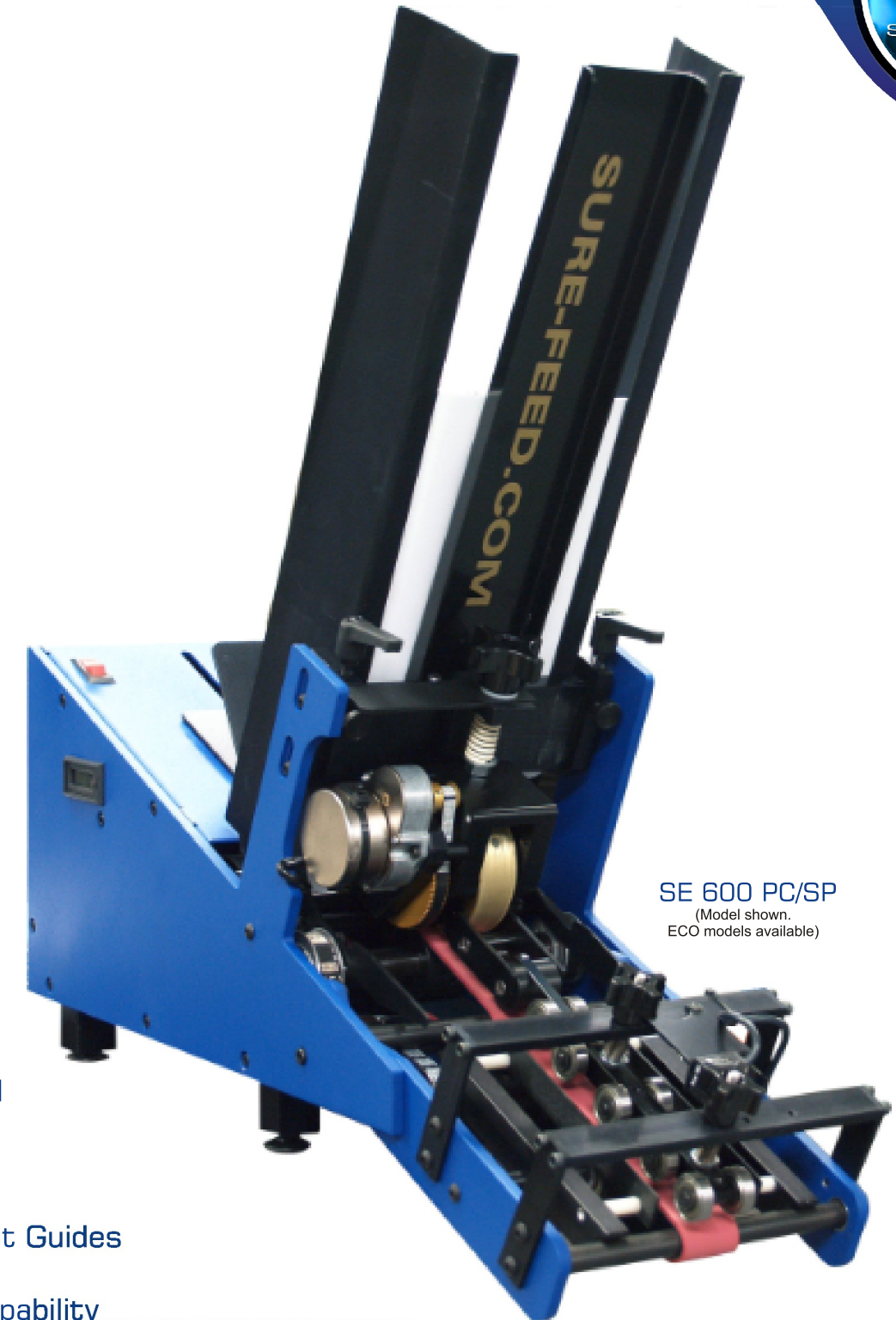
SE 600 PC/SP (Model shown. ECO models available)

Optional Features: Stainless Steel, Double Detect, Stand, Light Tower